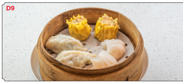
NICE DAY DIM SUM PLATTER Chicken & Shrimp Shumai (2 PC) Veg. Dumplings (2 PC) Shrimp Dumplings (2 PC)